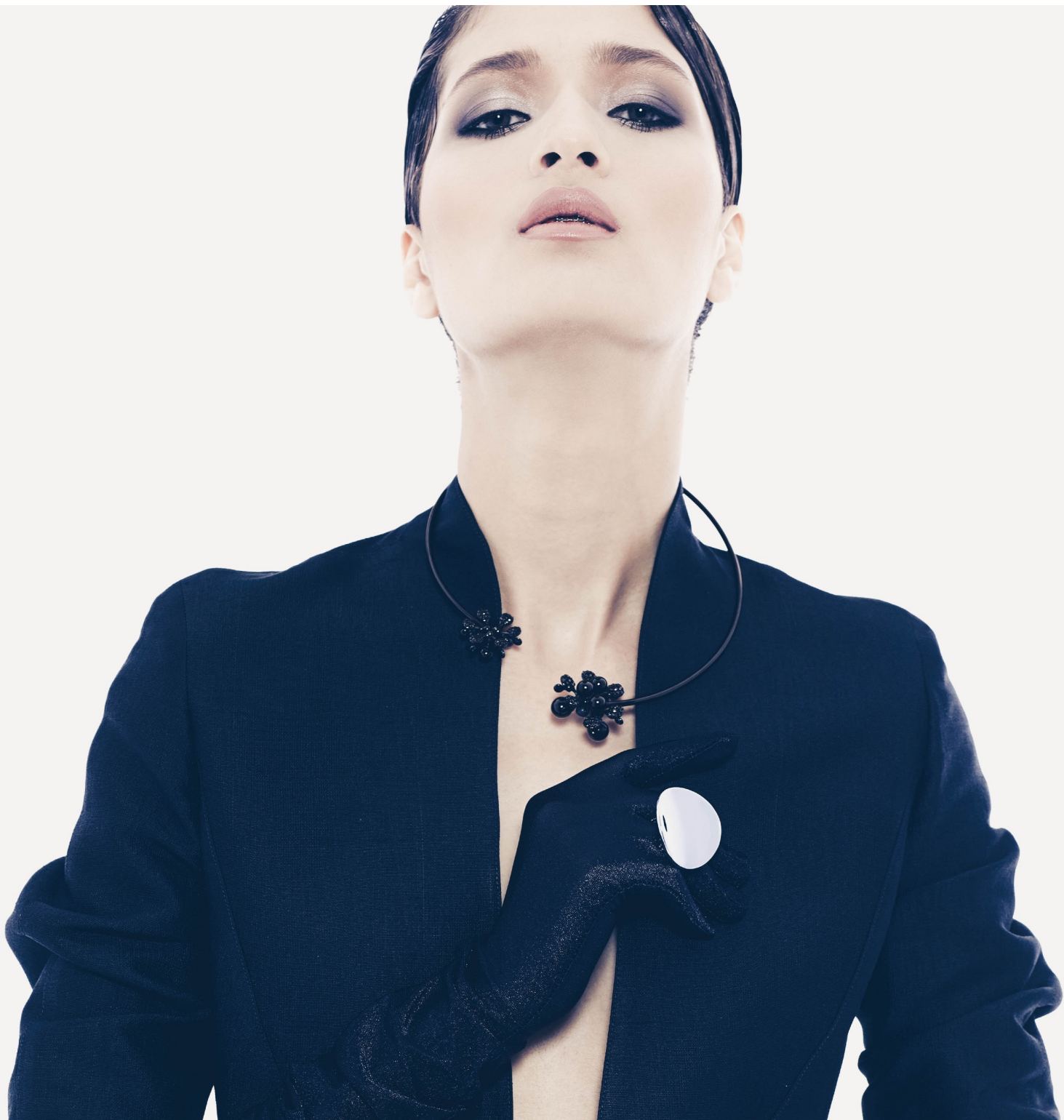
Redefine Nature Collection Seed Necklace