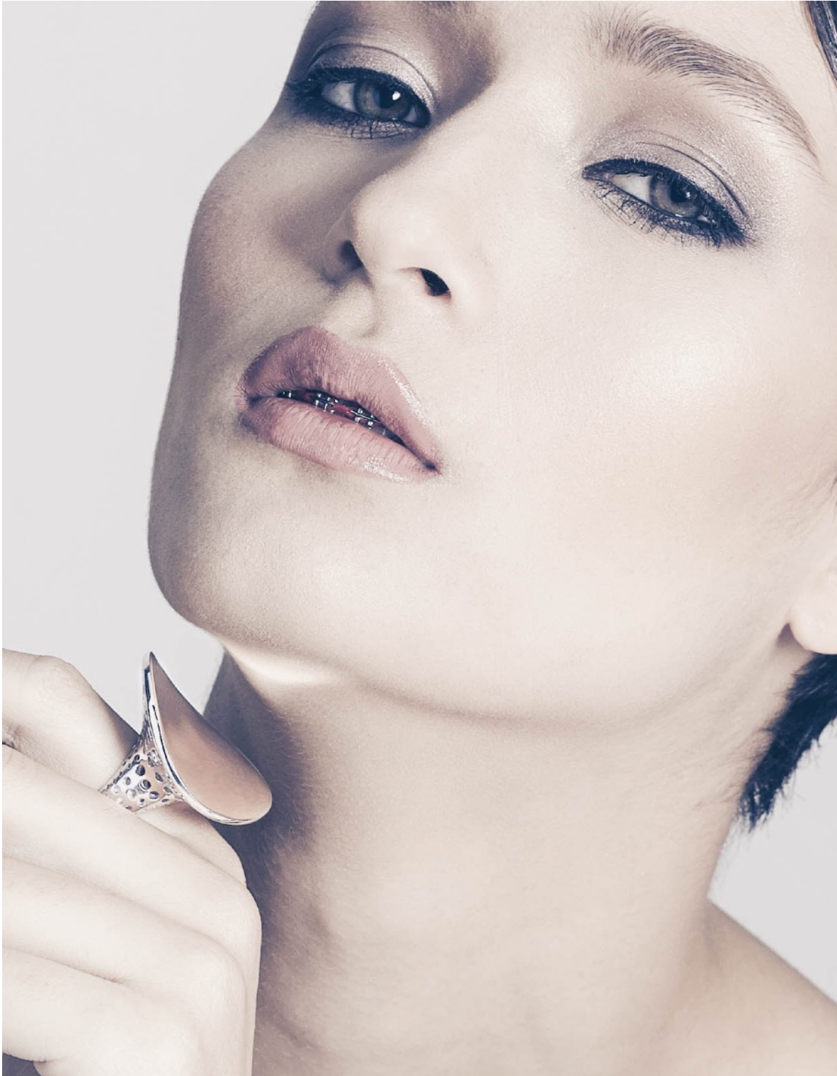
Opera Collection Ad lib Ring